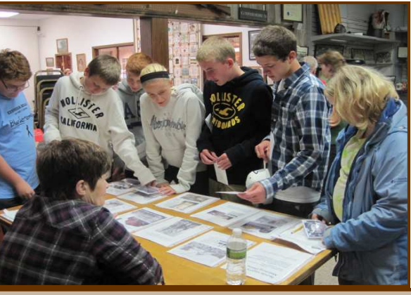
Nunda Historical Society Museum & Rose Shave Gallery are open on Sundays, 2 - 4 PM, April through November and at other times by arrangement. Call 468-3879 or 468-5991